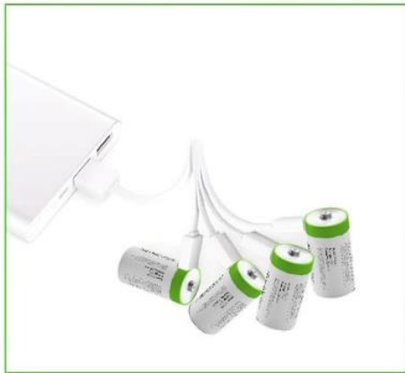
Power Bank Charging