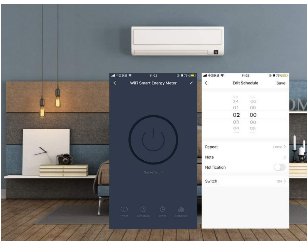
Set automatically off air conditioner in the middle night to avoid catching cold