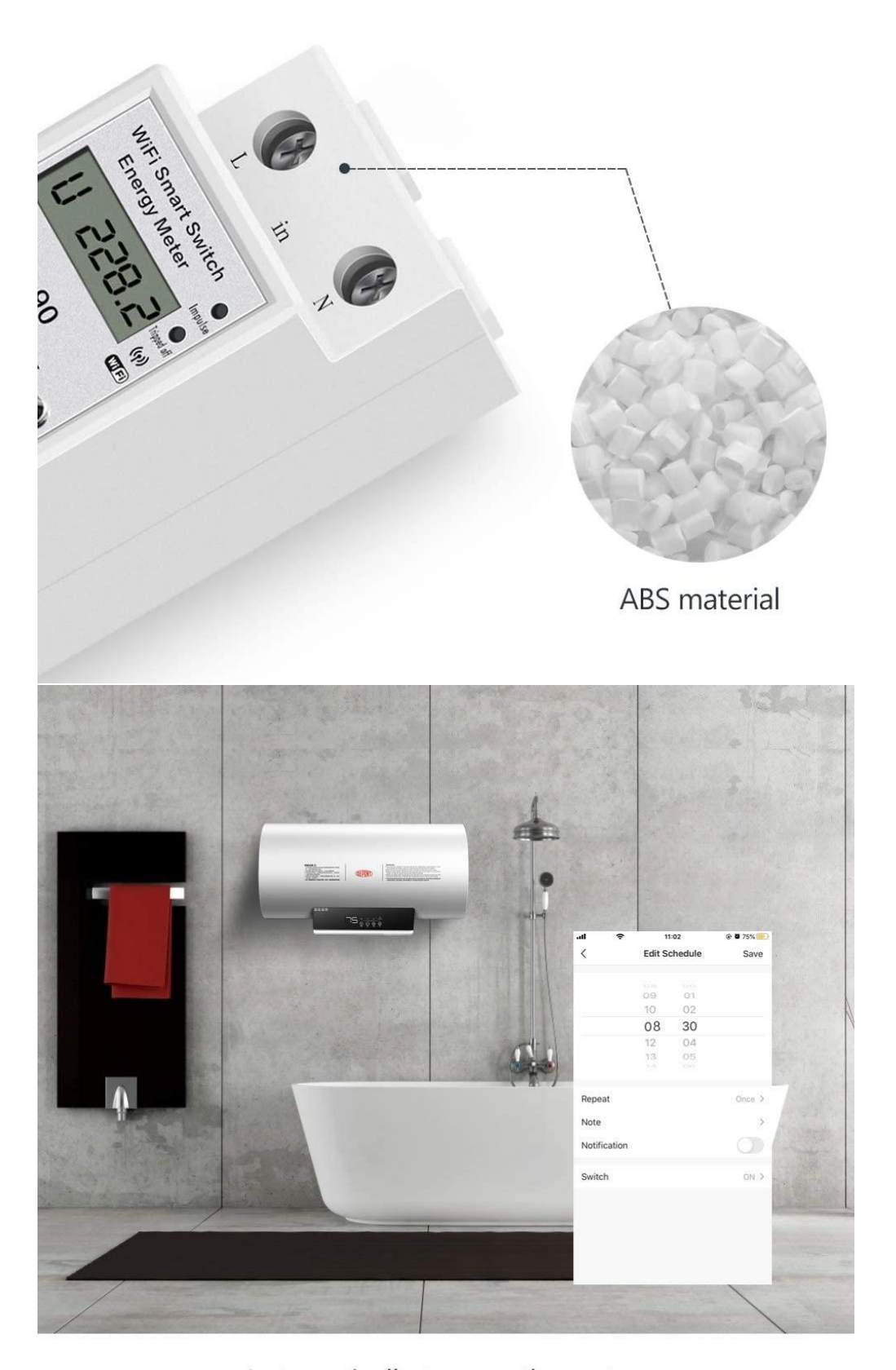
Automatically turn on the water heater every 8:30 p.m, you can enjoy your bath time once getting home

excellent impact resistance, Good insulation, heat/cold resistance more safer