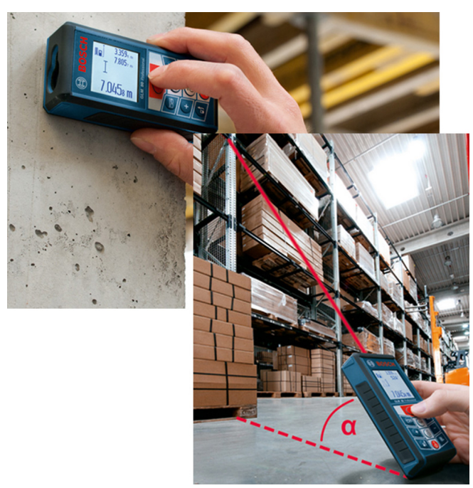
Made in China