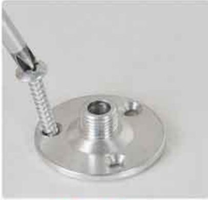
First Step Screw the fixing plate