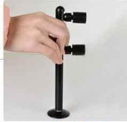
Third Step Rotate the lamp body clockwise and tighten it