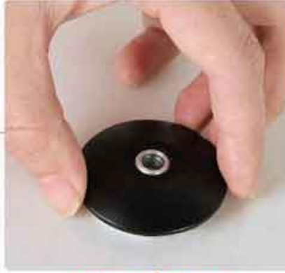
Second Step Set into the plate that has been fixed